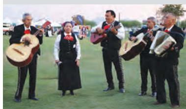
Mariachi Mexico Nuevo performs during the Salsa Night Market

On Saturday night, salsa enthusiasts gathered at the Salsa Night Market at Copper Sky Regional Park to carry on a tradition that started over a decade ago.