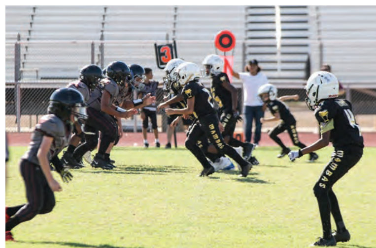
Maricopa Mambas play against AZ Krush at Vista Grande High school.