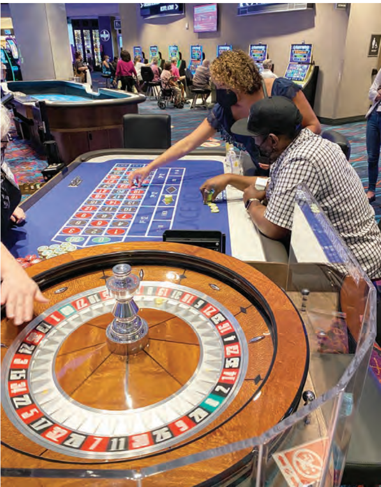
Roulette is the latest table game to be added to Harrah’s Ak-Chin Casino’s gaming floor.

Earlier this year, the Arizona State Senate passed HB 2772 amending the current gaming compact allowing tribal casinos the opportunity to add additional live table games to their current offerings. Since then, Harrah’s Ak-Chin Casino has added Craps, Baccarat and now Roulette to the casino gaming floor.