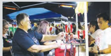
Participants enjoy samples from Salsa Patron, previous winners of the Salsa Contest.

The evening also included performances by Mariachi Mexico Nuevo, Ballet Folklórico de Santa Maria, Santa Cruz Valley Union High School Mariachi Band, Ollin Yoliztli Folklórico and the Zona Libre Band. A wide variety of vendors and food trucks were also at the event.