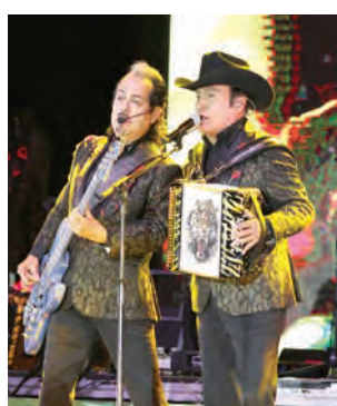
Hernan and Jorge Hernandez sing a duet. Eduardo Hernandez on saxophone.

Los Tigres del Norte provided the opportunity