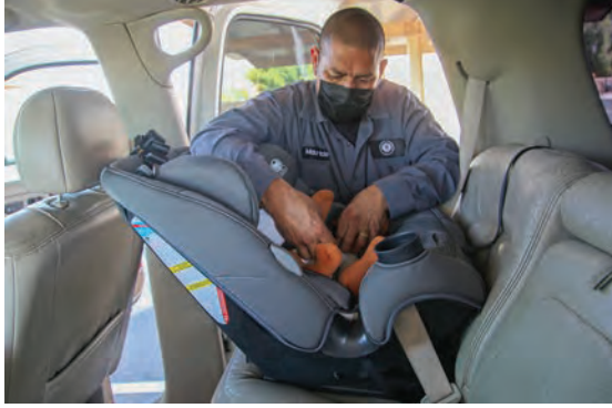
Left and Top Right: Ak-Chin employees and members demonstrated the lessons given by Passenger Safety Technicians.

If anyone is needing a car seat, they are still available for distribution/education.