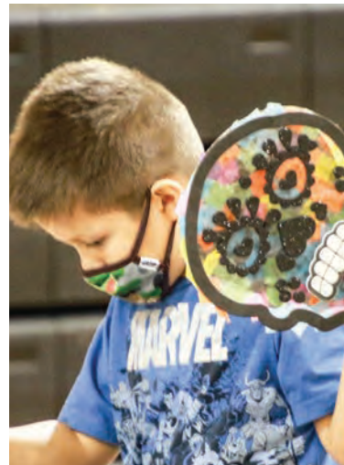
Kids craft during intercession.

Community members and employees took the opportunity to stop by for a free and much needed safety seat. A 30-minute training session was given by the technician. Families were taught how to properly and correctly install safety seats and how to safely secure children once in the seats.