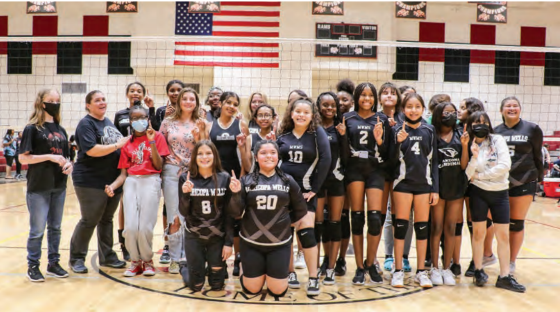
Above, Maricopa Wells Middle School Girls Volleyball celebrate their championship win against Maricopa Desert Winds, September 21.