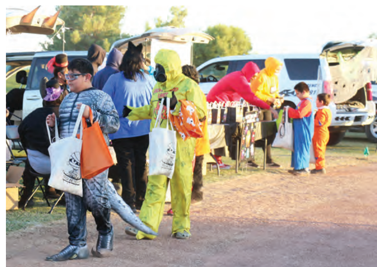
The Community gathers at the park, making their stops along the candy route.