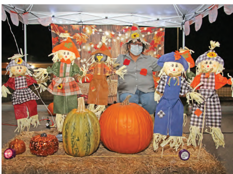
Scarecrows await their next visitors.

On October 22nd Ak-Chin Him-Dak held their first Halloween Trick or Treat Drive-Thru, for community families to enjoy displays full of creepy, crawly and cute decorations. Each display was crafted and assembled by Him-Dak department staff, following the drive line through each display, everyone was able to see ghosts, ghouls and witches.