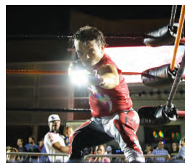
Extreme Dwarffanator wrestler "Tucker" in attack stance.