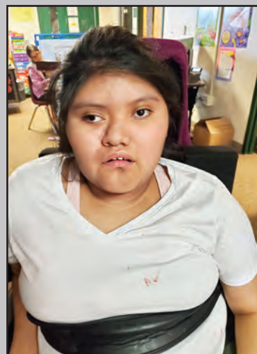
Unique Santiago Honor Roll- Photo submitted