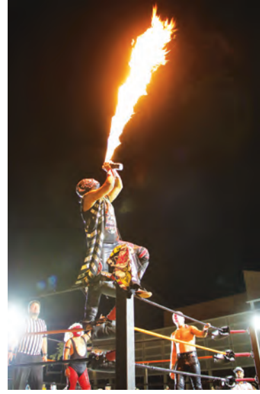
"Mini Fashion" ignites the night to intimidate opponents.

In addition to the wrestling, there were jumping houses, vendors and a costume contest for the crowd to enjoy. The band, Outliers, also performed.