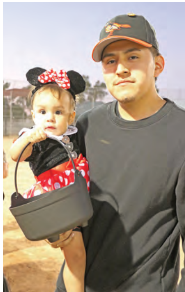
This little Minnie Mouse says Trick-r-Treat!