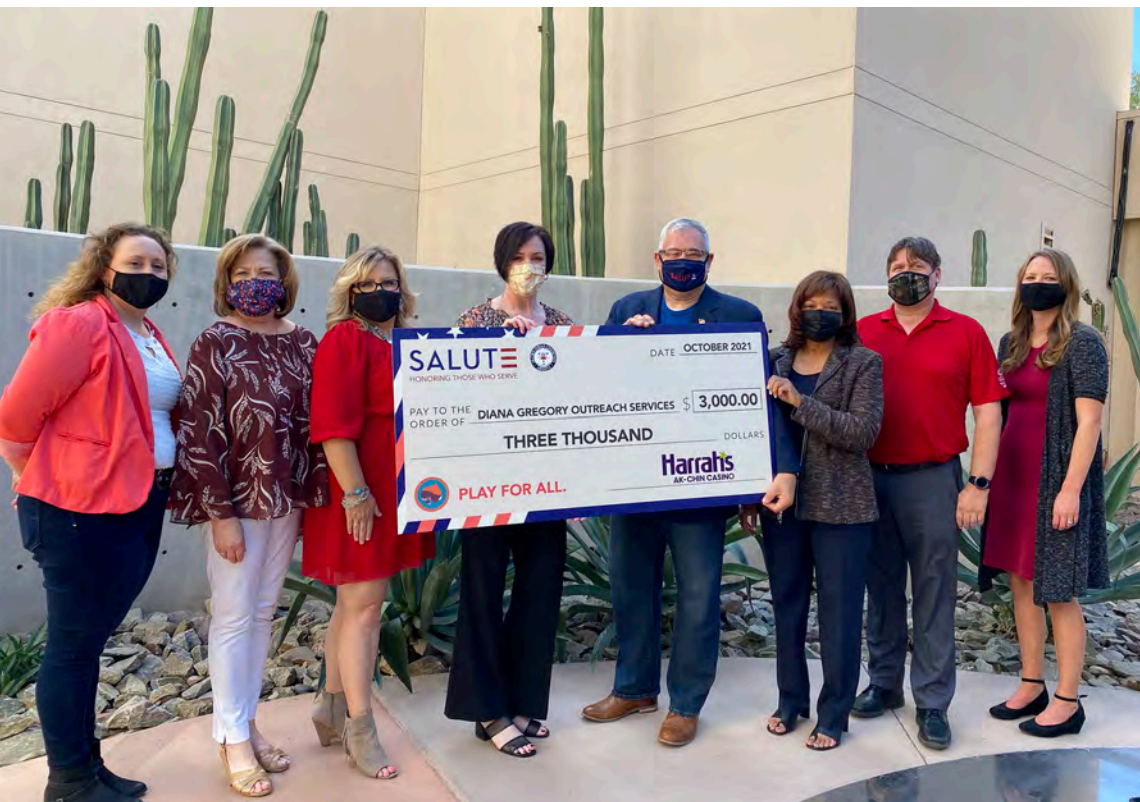
Harrah's Ak-Chin Casino SALUTE and HERO team members present a check for $3,000 to Diana Gregory Outreach Services. The funds will support the organization's Veggies for Vets program.

(MARICOPA, Ariz. – Nov. 2, 2021) – Harrah's Ak-Chin Casino, long-known for its corporate giving and community support, will once again honor Veterans and active military throughout the month of November. Events organized by Harrah's Ak-Chin Casino's HERO committee and the SALUTE Business Impact Group will create awareness and offer support for all community Veterans and active military as well as the organization's 30+ Veteran team members.