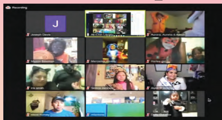
A screen shot submitted by Youth Council shows the virtual gathering during the Halloween Special.