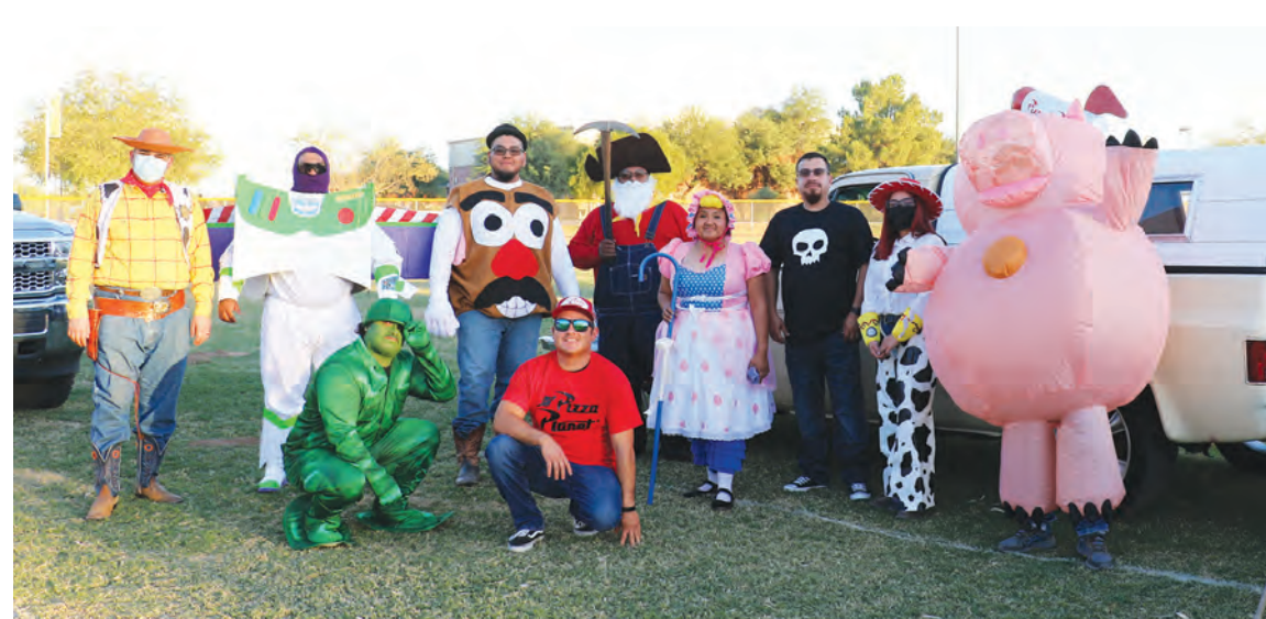
Sanitation/Public Works go full Pixar for the Trunk-or-Treat.

The evening ended with a Costume Contest just as the chilly night set in.