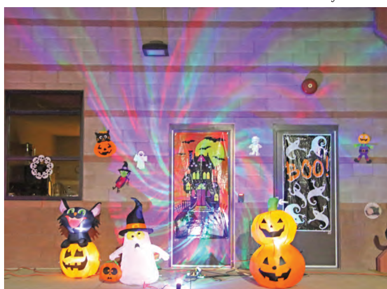
Many decorations lit up the night at the drive thru.

Pared with dazzling lights and Halloweenie music passersby got an eye full of holiday fun.