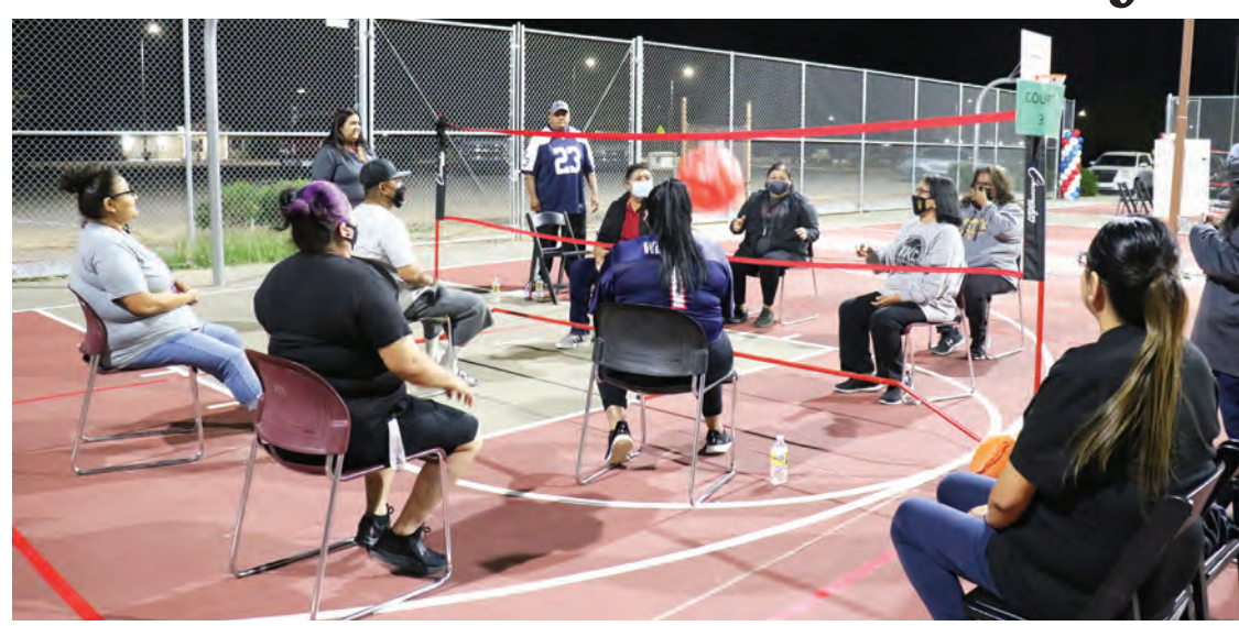
Tribal Council gets ready to send the ball back over the net to awaiting Lynx players.

Monday, November 22, Ak-Chin Parks and Recreation hosted what they plan to be an annual department event during the state's biggest college rivalries, Arizona State University (ASU) and University of Arizona (UofA) football game.