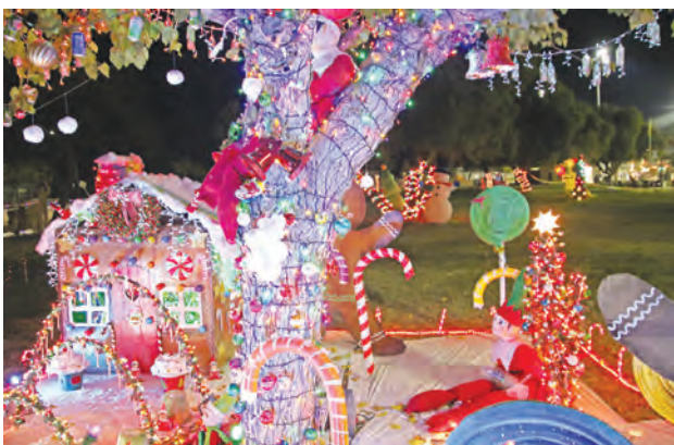
1 st Place: Team Safety, Central Plant, EPA, Airport and Security