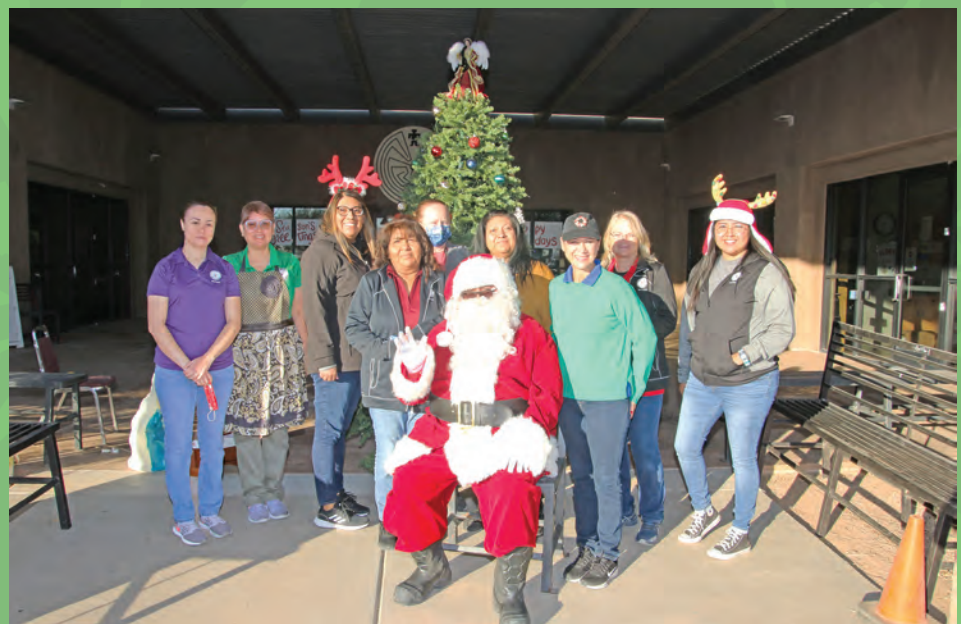
Above, Elder staff go above and beyond to create the great drive thru event for all Community elders. Below elder staff sort out gifts and work with Santa to ensure everyone on his list receives their gifts.