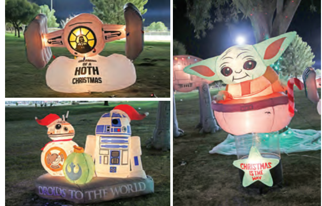
3 rd Place: Education Department