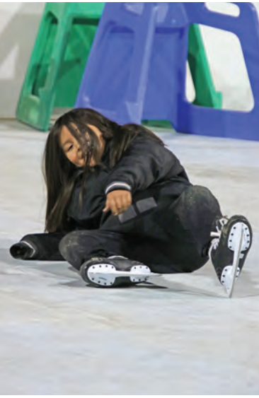
For some stepping onto to rink was an easy job and for others not so much. That night was full of ups and downs.