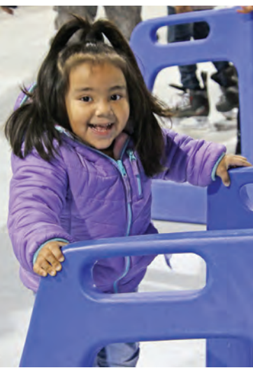
This little girl happily makes her way around the rink.