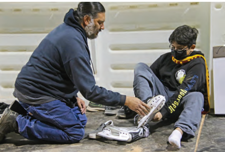
As tons of children made their way to the skating rink, parents help them fasten up their laces.