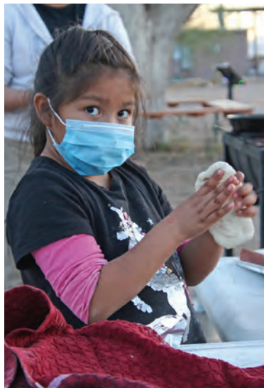
These girls make their own dough.