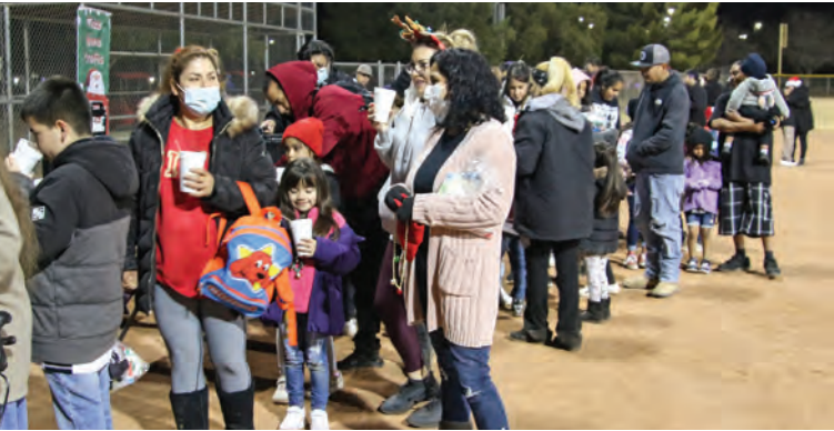
Everyone waits for refreshments and a visit with Santa.