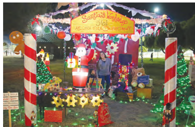
2 nd Place: Fire Department