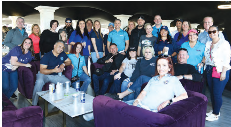
Harrah's Ak-Chin Casino staff enjoying the 2022 Waste Management Phoenix Open from the Loge Suite on the iconic 16th hole.

We had customers visit us from sister properties in New Orleans, Council Bluffs, Metropolis and Southern California, and they all had wonderful things to say about their visit to Arizona.