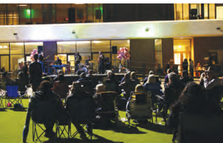
The audience enjoying a pleasant and romantic evening.

To round out the night, Carmela y Más, Latin Jazz & Salsa Band electrified the audience with their set.