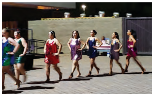
Indigo Ballroom Dancers present a well choreographed routine for the crowd.

Pleasant evening weather, a pink Valentine's gift bag and a variety of vendors welcomed attendees to the Latin and Smooth Jazz Concert at Copper Sky Regional Park on Saturday, February 12, 2022. The event, presented by O'Jon Enterprises, Maricopa Veterans Care (Project) and AMPS Magazine Phoenix, was a fun way for couples and singles to enjoy delicious food and lively music.