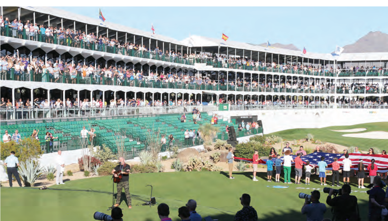
Opening ceremonies for the WHOOP Shot of Glory inside the famed "16th Hole" at TPC Scottsdale.