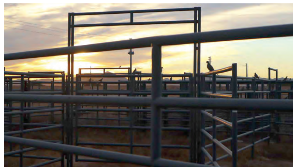
Top photo taken at the rodeo grounds behind Ak-Chin Circle. Below photo taken on the dirt road (bridge) behind fire department.

"As a photographer I thought it was only right to share pictures that I take of the community. I hope the community enjoys the photos that I capture as much as I do."