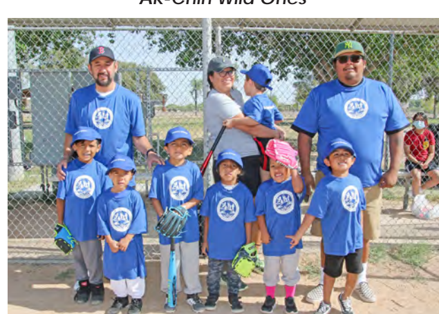
Ak-Chin Barking Spiders