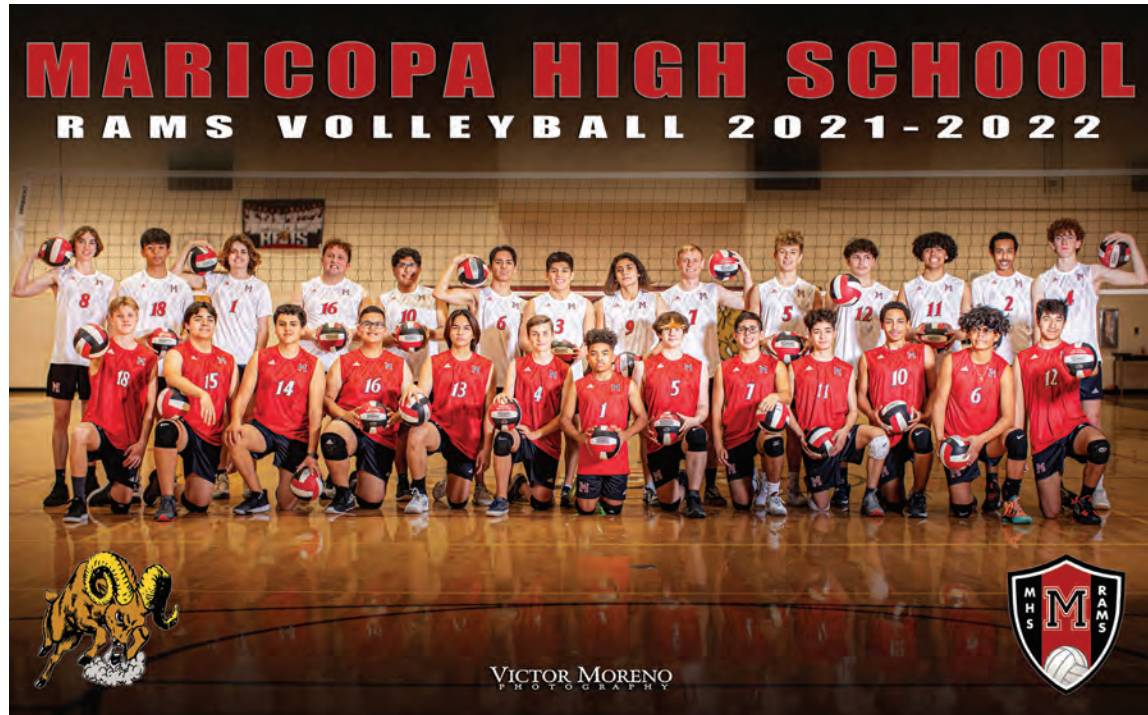
Maricopa High School Rams Boys' Volleyball. Varsity is pictured in white jerseys, while JV is pictured in red jerseys.

2022 has given us many things to look forward to. Maricopa High School's new Boys Indoor Volleyball program is definitely something we will be looking forward to seeing more of.