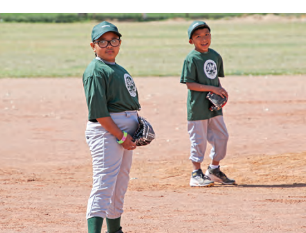
Teammates having fun.