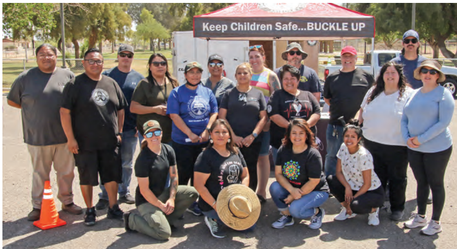
Car Safety technicians pictured at the Buckle Up Event.