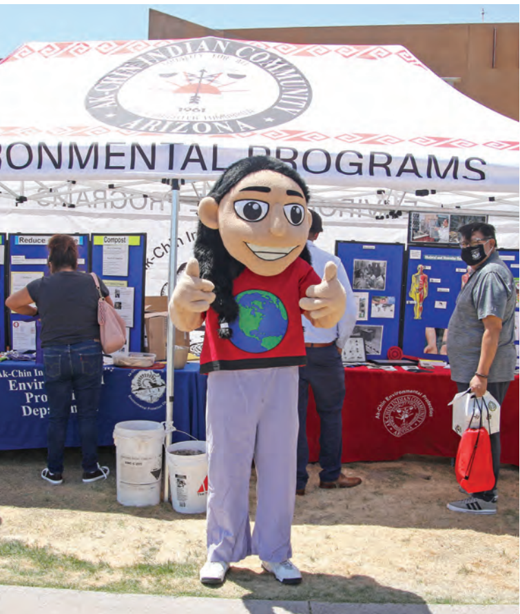
Earthy Enos gives two thumbs up to Earth Day 2022!

April 22, 2020, Ak-Chin Environmental Protection Department hosted their big annual Earth Day celebration.