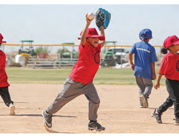
Happy to play ball.

If you'd like to come out and watch these little athletes shine, next games are Saturday May 7th and May 14th.