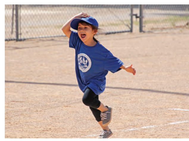
"Run, Run, Run!"