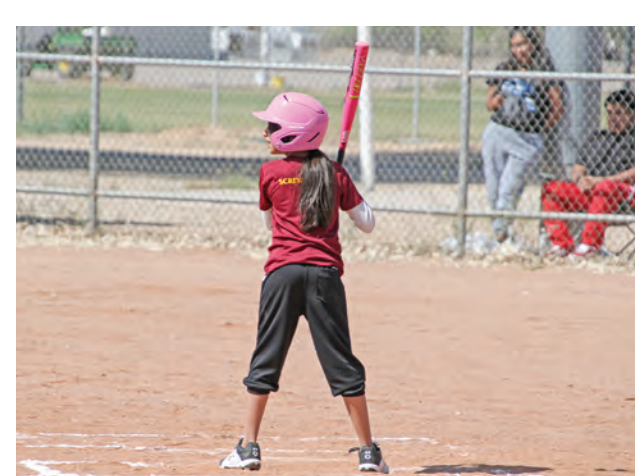
Waiting for the perfect pitch.