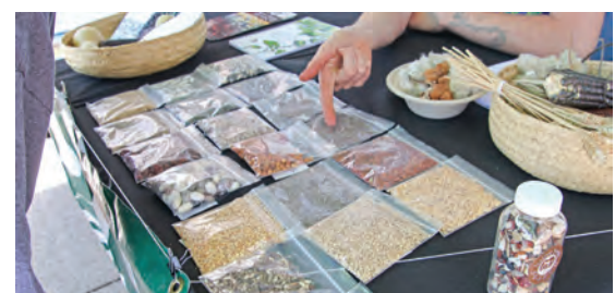
At the Native Seeds booth participants could take a quiz to see how many seeds they can recognize.

EPD staff also provided a few solar powered gadgets