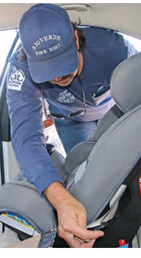
Car Seat Technician properly installs seat for a grandmother.