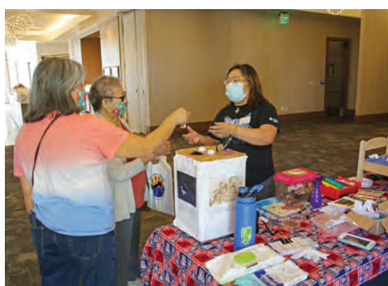
Earth Day event goes get a close up look at creepy crawly critters at the UofA booth.