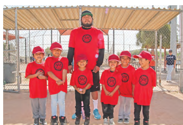
Ak-Chin Wild Ones