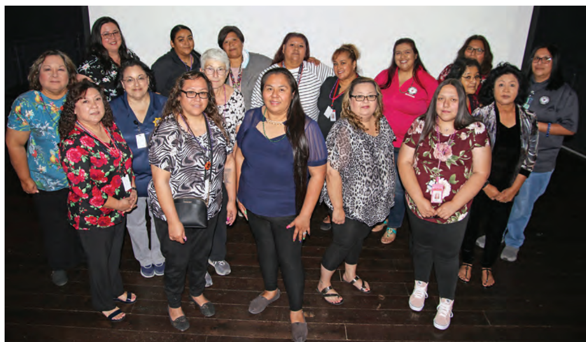
Department Administrative professionals attended a special luncheon celebration at Ak-Chin Circle Luxe Lounge.