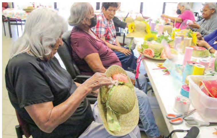
Mothers enjoy their Mother's Day craft.