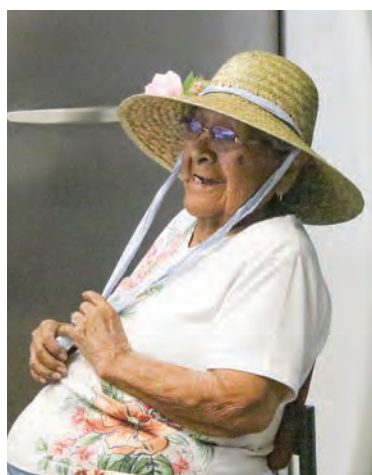
Something about these hats brought a smile to their faces.