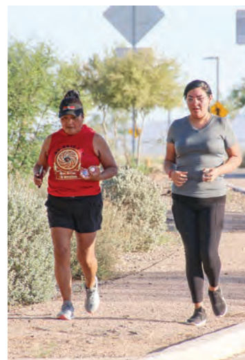
Running or walking everyone is having fun at the Health Education events.