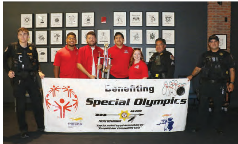
3RD PLACE - THE DISPATCH AGENCY