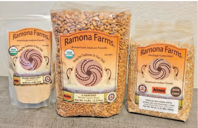
Products such as brown tepary beans from Ramona Farms were provided for the participants with the help from Vekol Market.

When asked by our sister tribe, Tohono O’odham Nation to participate and challenge Ak-Chin membership on trying to eat their “O’odham food”, Ak-Chin Him-Dak and Health Education departments worked together to bring Community members and residents to take part in this new kind of challenge, the 14-Day Traditional O’odham Food Challenge.