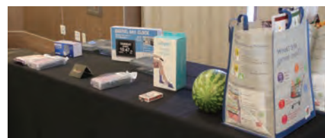
May 26, Ak-Chin Injury Prevention program hosted a Game Night for Older Adults, 55+ at Ak-Chin Circle Elements Conference Center.

The evening which offered plenty of fun and games, like O’odham Bingo, Musical Chairs and Uno, also provided many great prizes and a dinner box.