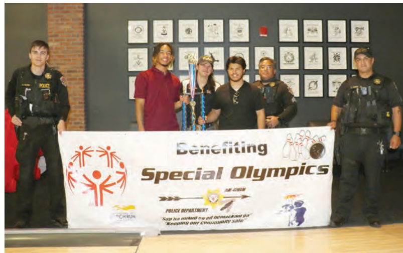
2ND PLACE - THE PIT CREW