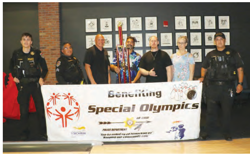
1ST PLACE - HARRAH'S 1

The Special Olympics goal is to "help persons with intellectual disabilities participate as productive and respected members of society at large, by offering them a fair opportunity to develop and demonstrate their skills and talents through sports training and competition and by increasing the public's awareness of their capabilities and needs."