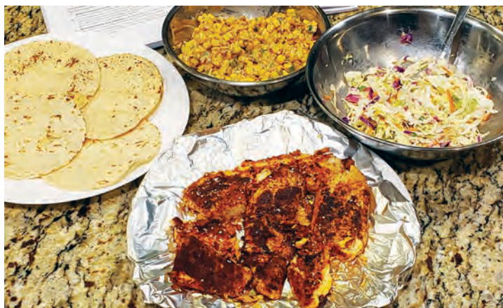
Participant family's finished meal, including fish, grilled corn tortillas, cole slaw and corn salad.

Thinking about how back then they had to struggle and ration their foods because they weren’t able to produce food as fast as we can today, gave me more of a prospective on how we shouldn’t take things like crops and water for granted.”