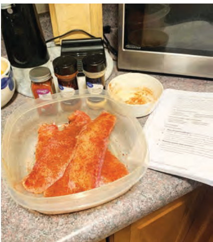
Seasoned with smoked paprika, chili powder and garlic powder, this tilapia is ready for the frying pan.