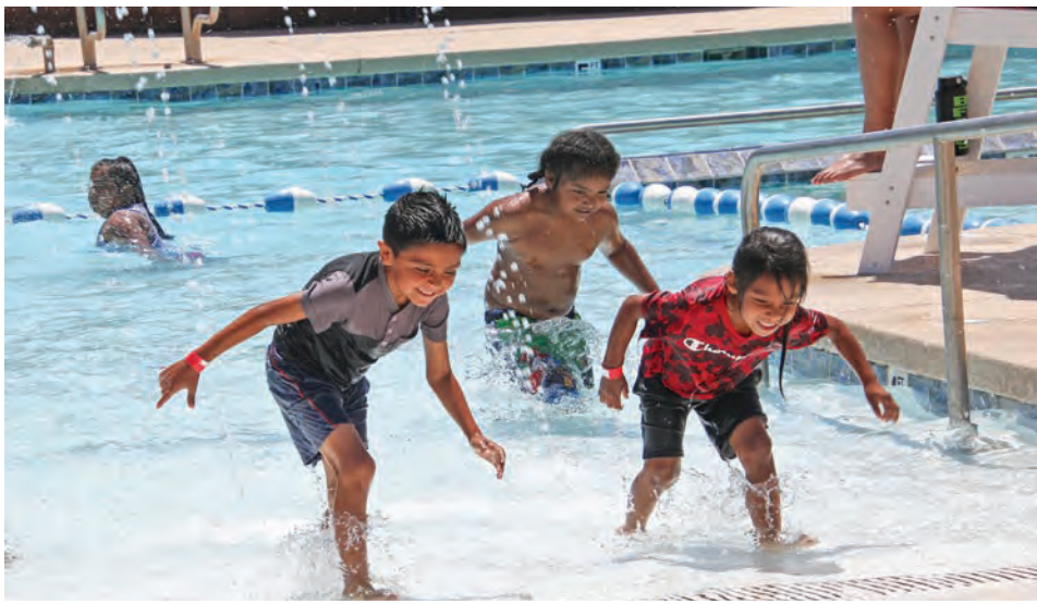
Children and parents have a nice time enjoying their Saturday at the pool.

A Big Thank You to our Volunteer Coaches and helpers for your time, patience, hard-work and dedication, you’re a great