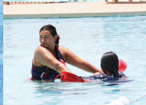
Lifeguards go through training exercises.

How do you stay alert while there are so many people in the pool? By counting all the people in the pool and getting good sleep