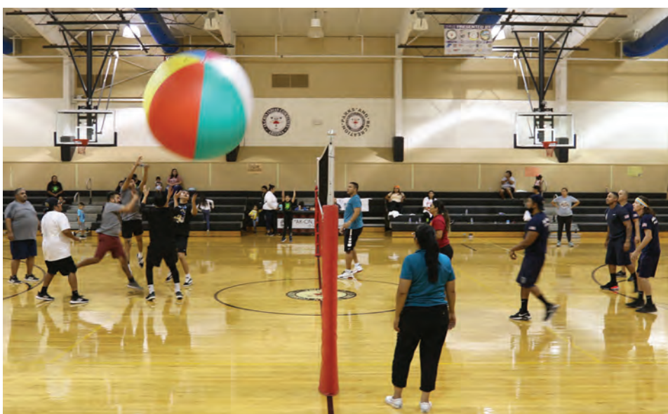
At left, Water Operations Team volleys the Mega Volleyball back to Fire Department, at right, during the championship game on Tuesday, June 14 at Ak-Chin Recreation gymnasium.

Who we are: The Inter Tribal Council of Arizona (ITCA) is a 501(c)3 nonprofit organization which serves as a tribal consortium for 21 of the 22 tribes in Arizona. ITCA coordinates its efforts through a wide variety of service areas including Economic Development, Public Health, Research and Environmental Quality programs and services. The highest elected officials for the 21 Tribes in Arizona, serves as a member of the Board of Directors for ITCA.