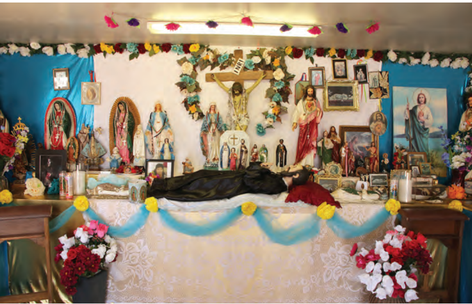
Above, the Miguel's San Juan church is festively decorated in honor of their patron saint, San Juan.

Friday, June 24, Community, family and the faithful attended the Miguel family San Juan Feast held in the family compound. Early that morning a rosary and procession were held, shortly after the lines for the “Drive Thru Feeding” started to get busy. It was so busy that the family ran out of their traditional meal just before noon. In addition to the meal, patrons could stay and listen as the Pap’kola Dancers from Tohono O’odham Nation shared music and dance, as well as a short history lesson Pap’kola. Music by Patcho’s Band provided much needed entertainment for the day.