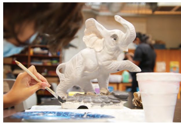
Kids enjoy their time at the Summer Art Program.