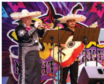
Above: Santa Cruz Valley Union High School Mariachi and the Ollin Yolitzli Mariachi and Ballet Folklorico