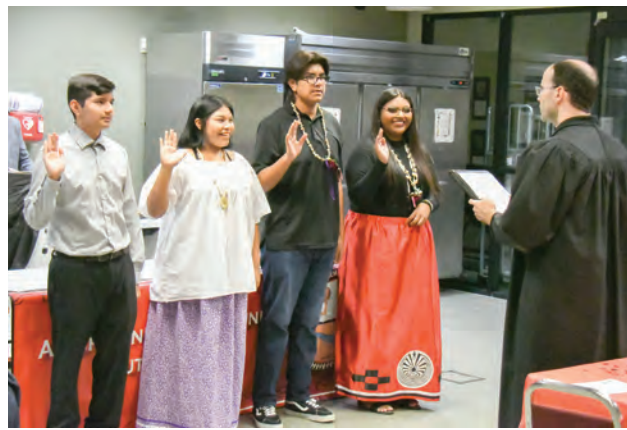
Some pictures of the Youth Council Oath of Office ceremony.

We would also like to thank the Elder Center