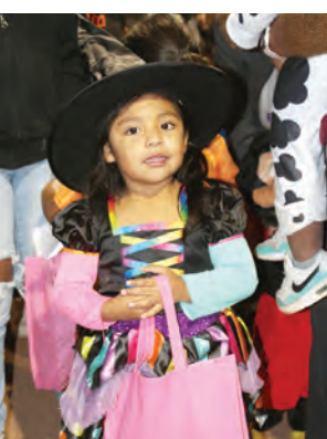
Cute little witch and Link have their candy bags ready!