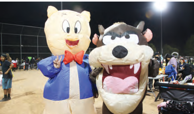
Porky Pig and the Tasmanian Devil up to no good.