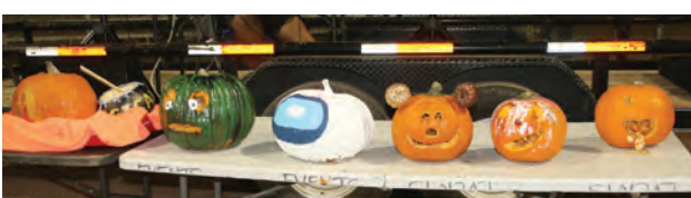
Winning pumpkins on display