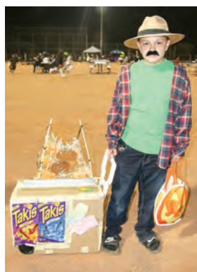
Little entrepreneur making his candy rounds.