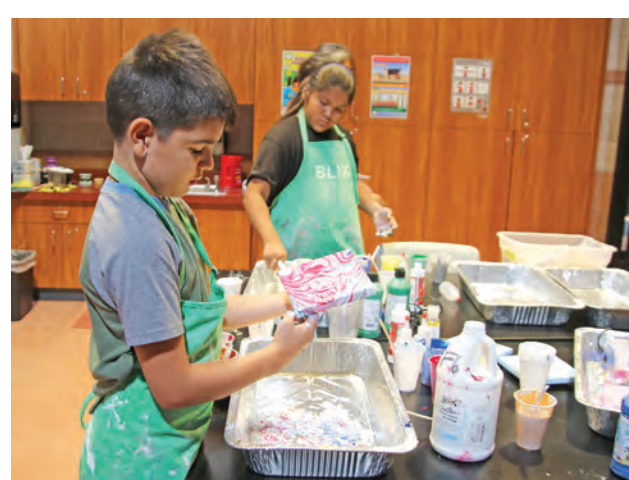
Everyone having a fun time at the Fall Art Program.