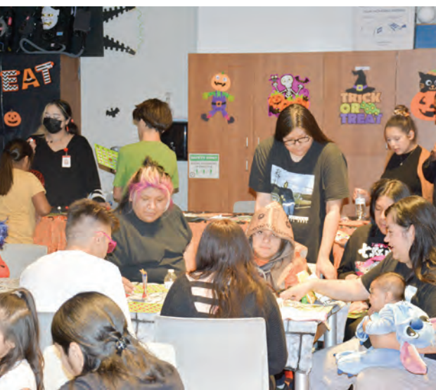
Lot's of tricks and treats as ghouls walked the halls of the Art Building during the Halloween party.

Ak-Chin Him-Dak revived their Halloween Party on October 19, for community members and residents. The Him-Dak staff decorated the inside of the Art building classrooms and hallway walls.