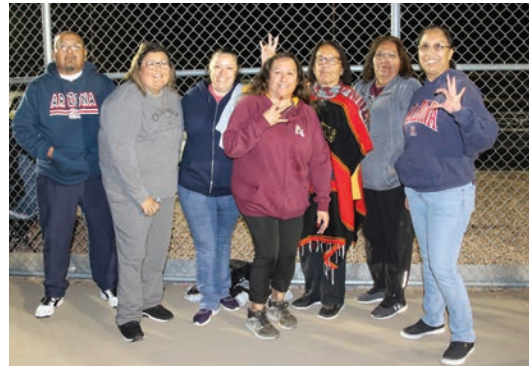
SECOND PLACE - AK-CHIN R US