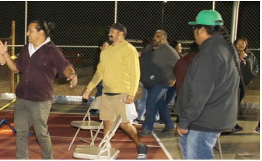
THIRD PLACE - THE RINGERS

To make the night even more fun between games, ASU-