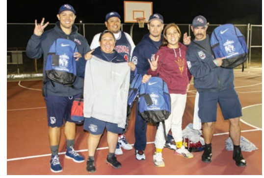
CHAMPIONS - AK-CHIN FIRE