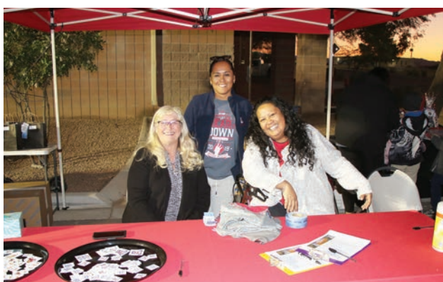
Staff members gather for a photo.