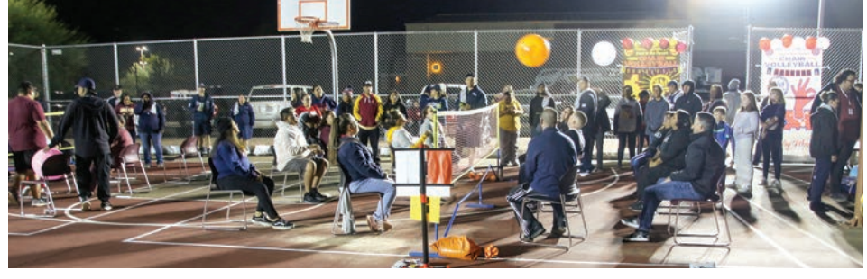
Team Ka-Ching and Harrah's Ak-Chin volley for bragging rights as everyone else follows along.

Ak-Chin Recreation staff thanks everyone for coming out and encourages teams to work together, build camaraderie, practice communication and have a good time.