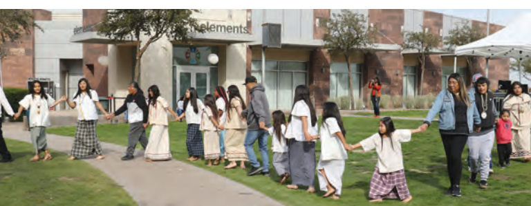
Everyone gathers for the Social Dance