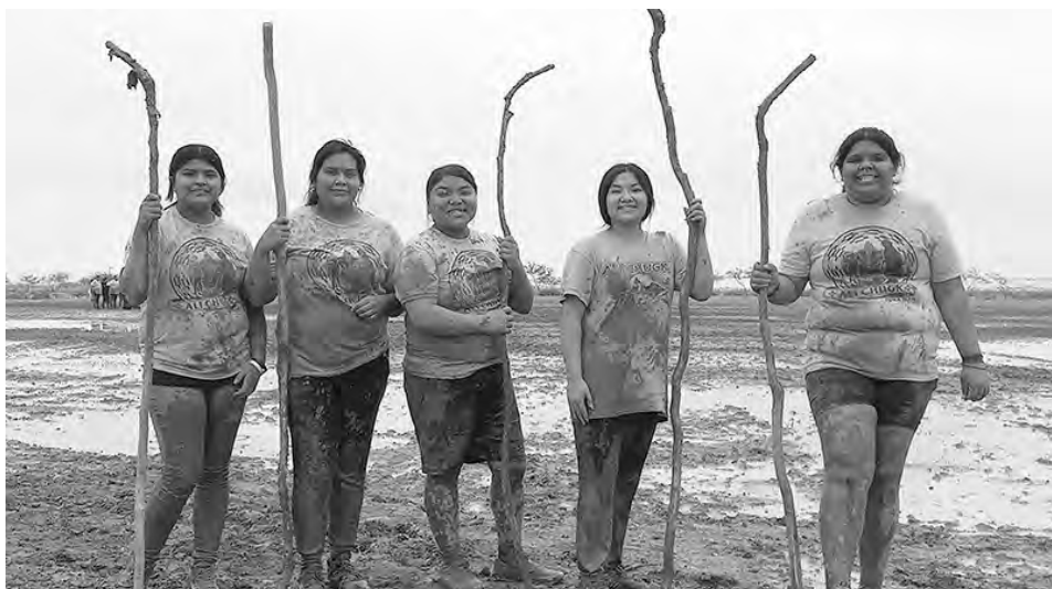
"Thank you so much for the warm hospitality. The ladies had so much fun. We had a great time. We truly appreciated the lunch as we were on a budget. Thank you, Ali Chugk Toka Team"

After it was all over, there were many muddy faces and feet, bruises and scrapes to remember the day, along with the utmost respect to all players for braving the flooded roads and fields to play these traditional games once played by their ancestors.