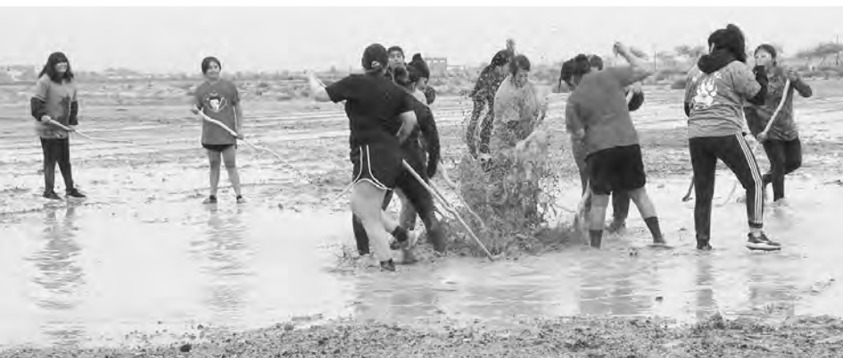
Ak-Chin S-kubjuv Ju:dam makes a big splash in the toka tournament.

Traditional Events continued from page 5