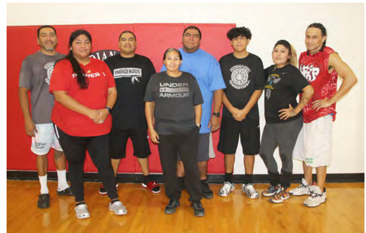
3rd Place: Rezurrected

Prevent the spread of flu and other respiratory illnesses by rolling up your sleeve to get a flu shot.