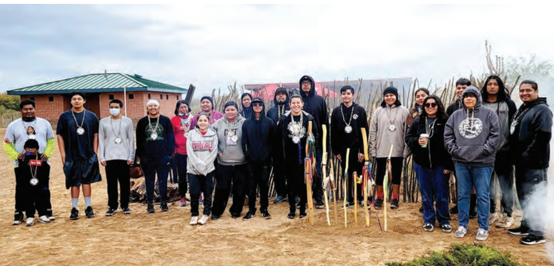
Above, runners gather at the Old Vaila Site after completing their spiritual run on December 3.

Over the first weekend of December, Ak-Chin Indian Community kicked off the 2022 Masik Tas “birthday” celebration, with a spiritual run and traditional games.