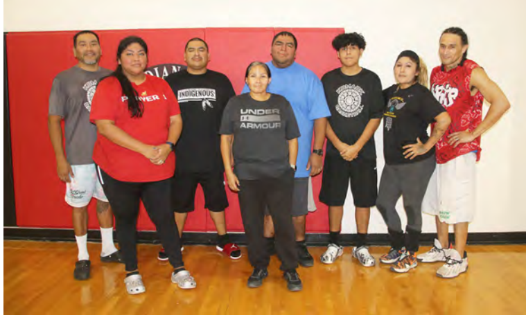
2nd Place: SQUAD

with scores very close throughout. At the end of the tournament it was Icy Hot who took the championship with, Squad placing second and Rezurrected coming in third. Placement teams earned t-shirts with special award to championship, All-Tourney and MVP awards for top male and female.