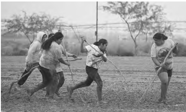
Above: This corner cone saw plenty of action, as both teams battled to find the 'ola.