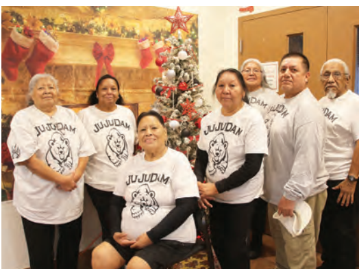
THIRD PLACE - JUJUDAM