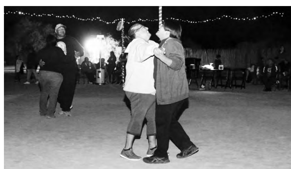
Dance contest participants stepping and moving to the beat