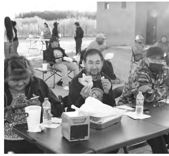
Popover judges taste testing entries from the four contestants.