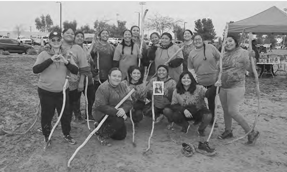
S-KUBJUV JU:DAM #LLC

Toka has gained popularity over the past 10 years and has been reborn with the younger women encouraged to play, as a way to keep the tradition going and a way to reconnect one another with their sister tribes and players. Many teams are multi-generational.