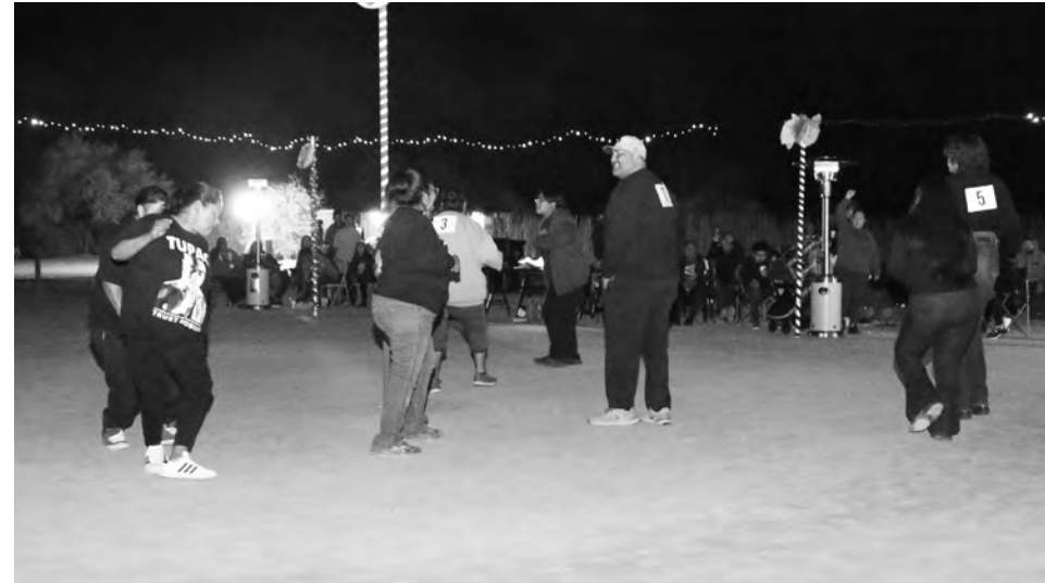
Youth dance contest participants competing in the categories of vaila (one step), chote (two step) and Cumbia