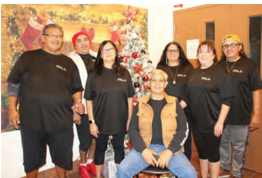
CHAMPIONS - PALA TURTLES