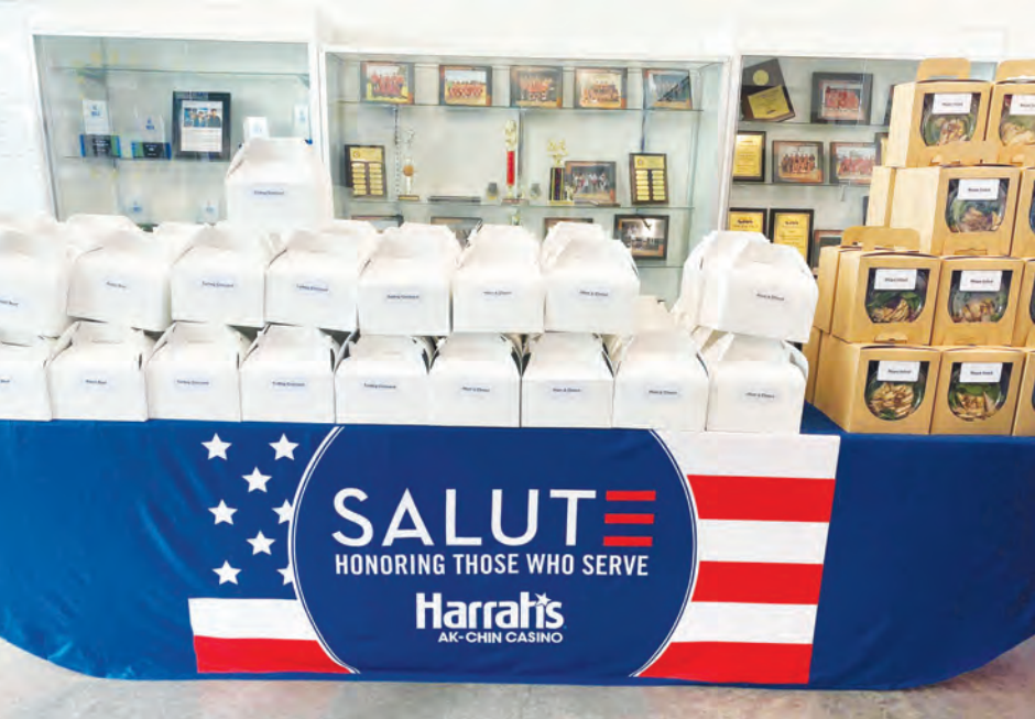
Harrah's Ak-Chin Casino SALUTE team members prepared and served box lunches to Veterans who attended the Maricopa Veterans Day parade.

(MARICOPA, Ariz. – Dec. 6, 2022) – Harrah's Ak-Chin Casino, long-known for its corporate giving and community support, donated to the Maricopa Veterans Day parade. In addition, the culinary team prepared 300 box lunches that SALUTE team members served to Veterans who attended the Maricopa Veterans Day