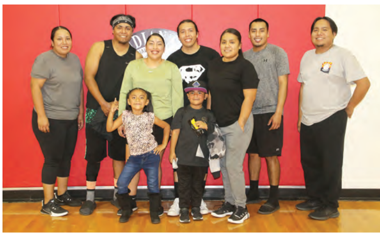
First Place: ICY HOT