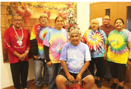
SECOND PLACE - UNKNOWNNS