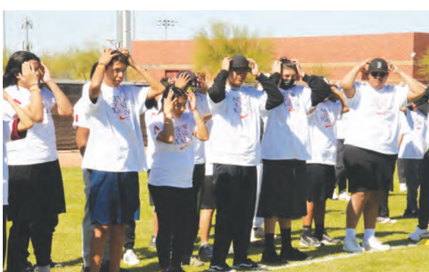
Ak-Chin kids participating in various activities and posing alongside athletes such as Notah Begay III (Golf), Christian Watson (Football), Davante Adams (Football) and Jacoby Ellsbury (Baseball).