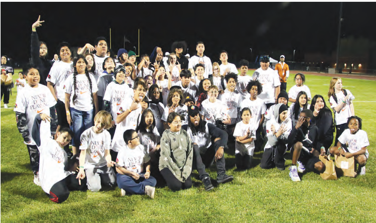
Davante Adams, wide receiver for the Las Vegas Raiders makes a silly pose with attendees of the Nike N7 experience during Football night.