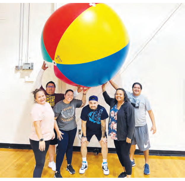
2nd Place: Limp'N Ain't Easy

Be sure to keep an eye out for Ak-Chin Recreations upcoming events, "seeing as they will be filled with just as much fun and laughter." Sonya shared.