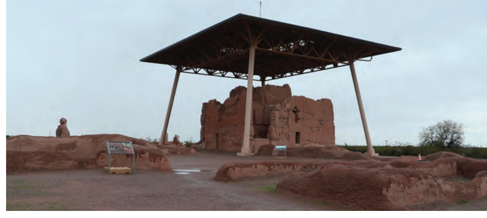
Story and photo by Jordan Rodriguez

On February 28, the Casa Grande Ruins National Monument in Coolidge, AZ offered its visitors a unique way to view the monument at night, free of charge.