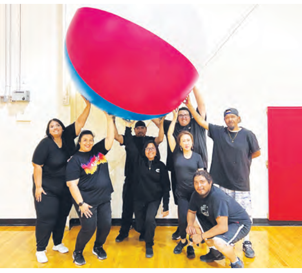
3rd Place: Ak-Chin Parks & Recreation