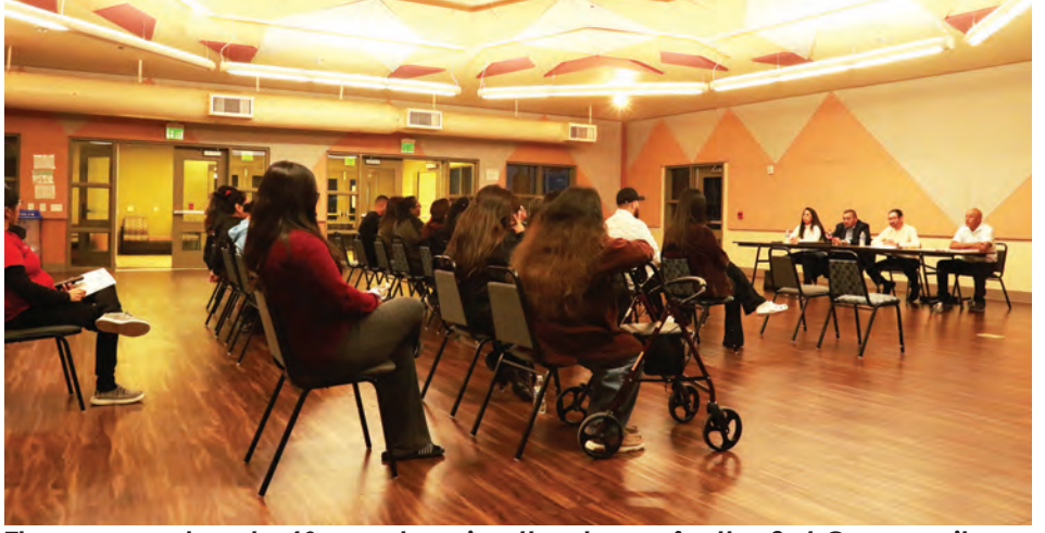
There were close to 40 members in attendance for the first Community Meeting held at Ak-Chin Service Center on Monday, January 29.

The first Community Meeting of 2024 brought out a pretty good crowd to Ak-Chin Service. I'm pretty sure the main reason for such a draw was the fact that the last meeting was held September 25, 2023, and so the membership had many questions that were unloaded during the January 29 Meeting.