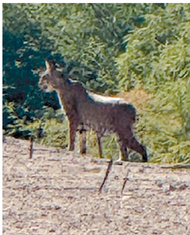
A bobcat was spotted in the wetlands of the community. The cat was one of a handful that have made the community their home.