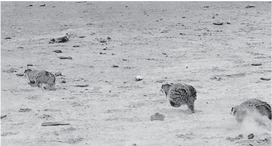
Three badgers race towards a burrow for safety in the community’s pastures. Badgers have grown in numbers over the past few years.

Any sightings of a mountain lion, or other wild animal in the community, please contact Ak-Chin Ranger, Harry Grizzle at 520-568-1220.