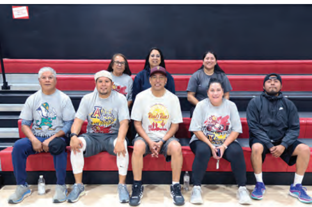
2ND PLACE TEAM REZ BALLERS