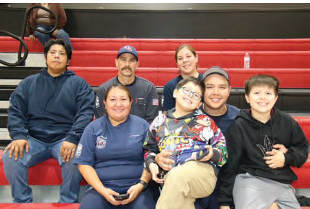
3RD PLACE TEAM ASH KICKERS-ACFD