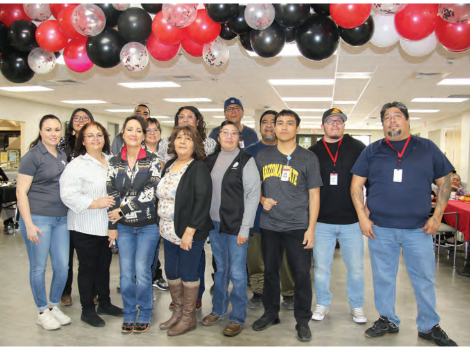
Ak-Chin Elder Center staff enjoy a group photo during their Grand Opening Celebration of the newly renovated Elder Center building.

A big thank you to Vekol Market for providing delicious food! Guests couldn’t stop raving