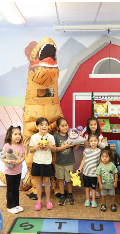
Dino Party Fun!

Many families stayed after the event, ending the morning with a tea party for the dinosaurs!