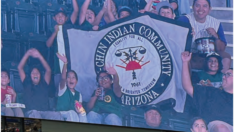
Ak-Chin makes it on the Jumbo Tron during the Washington Nationals vs Arizona Diamondbacks game. (photo submitted).