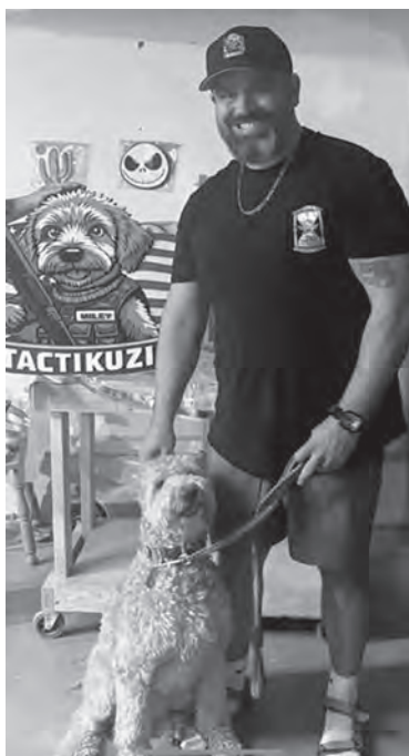
Harrah's Ak-Chin Casino has been recognized as an Outstanding Donor by Soldier's Best Friend.

Through Harrah's Ak-Chin's Caesars Makes Change NRT kiosk donation program, guests have the opportunity to support meaningful community causes by donating up to $0.99 in change when cashing out slot machine vouchers. In just six months, the initiative raised nearly $20,000 for Soldier's Best Friend.