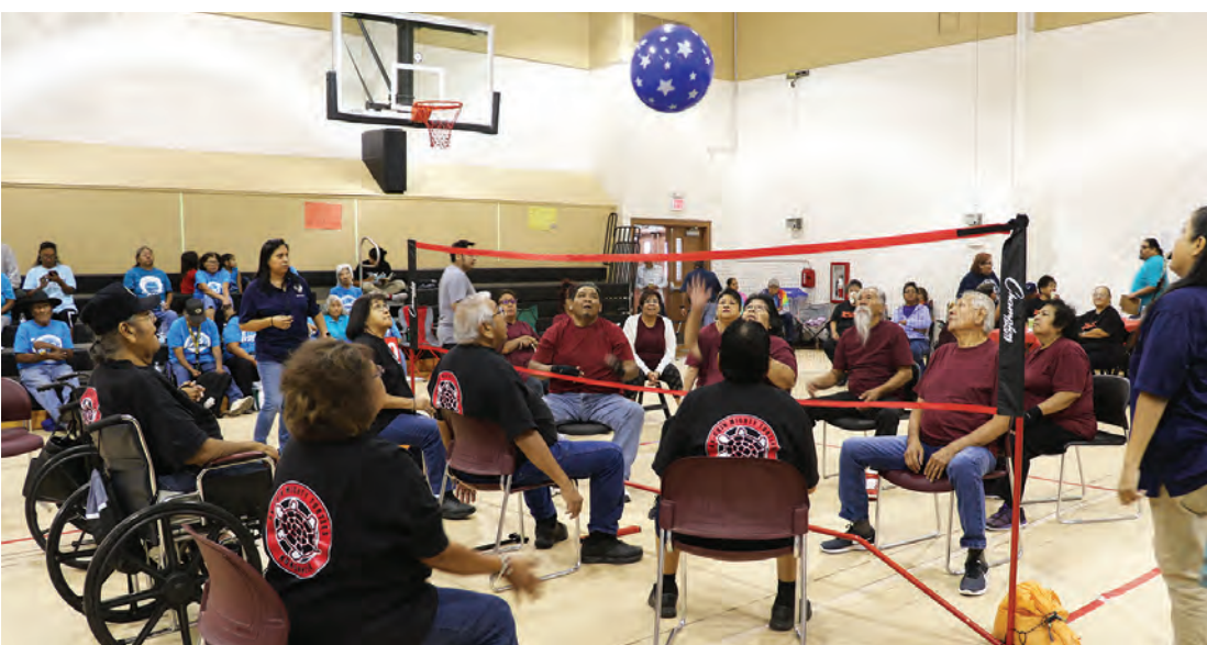
Mighty Turtles playing hard on their home court during the Ak-Chin Elder Chair Volleyball Tournament.