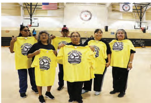
Bottom right: Third place winners Gu Achi Angels.

The Fall Ak-Chin Elder Chair Volleyball Tournament was held on September 20 at the Ak-Chin Rec gym. Many teams from surrounding Communities played for the championship.