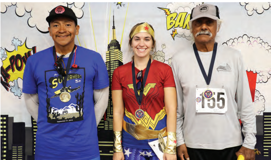
The top three runners pose for a picture in front of a super hero background at the end of the festivities.