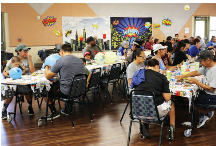
Right: Runners and families charge back up with breakfast and plenty of water after a warm day outside.