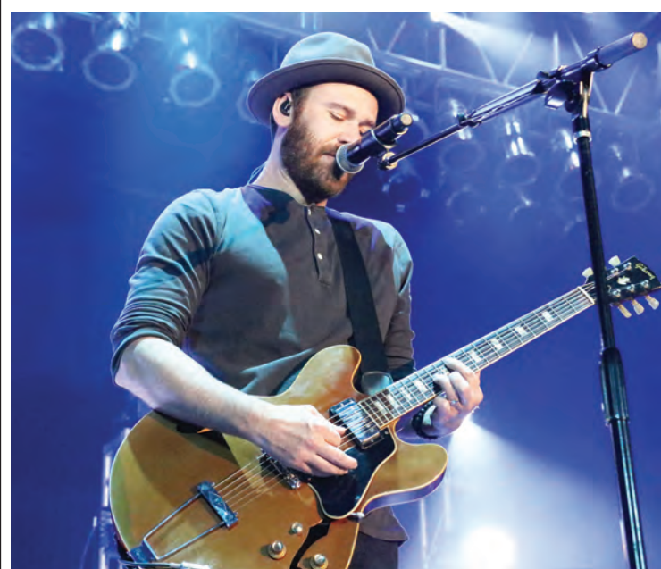
"Are there any old school Lifeshouse fans out here tonight?" lead singer and guitarist Jason Wade asked the crowd. The audience erupted. Here, Wade takes the spotlight and croons to the fans while playing rhythm guitar.