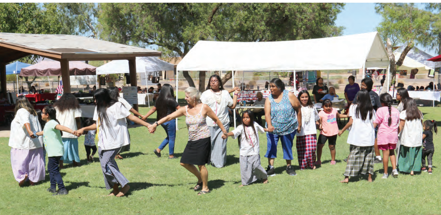
Keli Akimel Hua Modk Cudkdam Dancers lead everyone in a Social Dance at this year's NARD celebration.

The day was perfect! Perfect for the brisk morning walk, strong comradie and great line up of entertainment that awaited all who attended Ak-Chin Him-Dak's 2019 Native American Recognition Day, "Si Has E'lid Eg O'odham Neo'ok" (Celebrating O'odham Language).