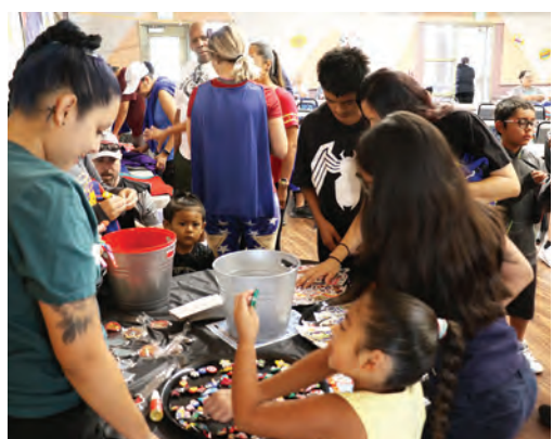
Above: Families look through super hero-themed stickers, bracelets and trinkets.