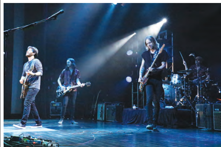
Lifeshouse took the Harrah's Ak-Chin stage by storm and wowed the crowd with their tight performance.

As expected, alternative rock veterans Lifeshouse brought a great evening of tunes to the Harrah's Ak-Chin crowd. Lifeshouse did not miss a beat and shelled out fan favorites like, "Wash," "Disarray," and "Sick Cycle Carousel."