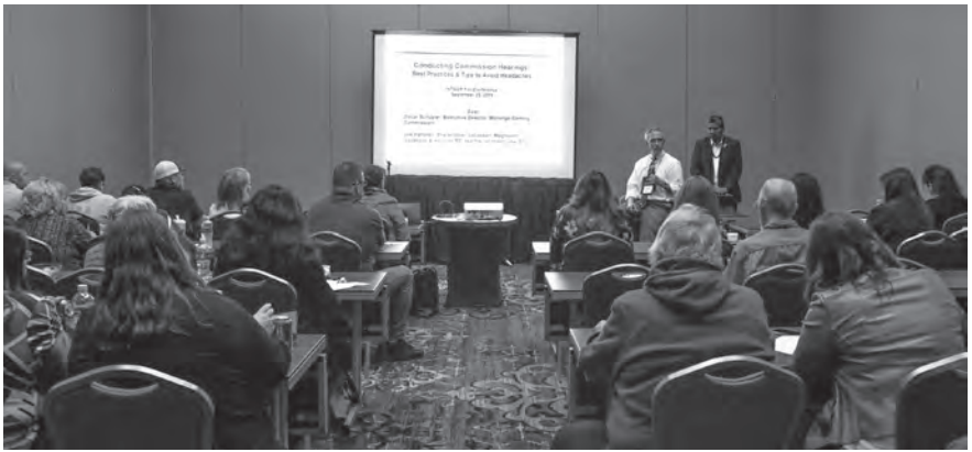
Tribal Gaming Commissioners and staff from all over came together for the 2019 Fall Conference. This year's conference was held at Harrah's Ak-Chin Casino Event Center. Three days of packed learning opportunities with over 30 workshops were offered. The NTGCR promotes relationships among commissioners and regulators in the tribal gaming enterprises and other organizations.