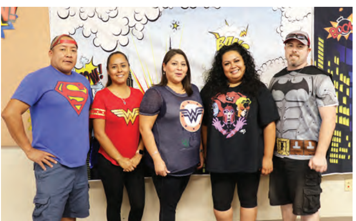
Above: Ak-Chin Health Education department poses in their super hero outfits after a long morning of hard work.