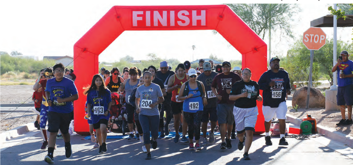
Super Hero 5k participants jump ahead out of the gate to begin the course around the Community.

Ak-Chin Indian Community was up, up, and away early on the morning of Saturday, September 21 to take part in the third annual Super Hero 5k put on by the Ak-Chin Health Education department.