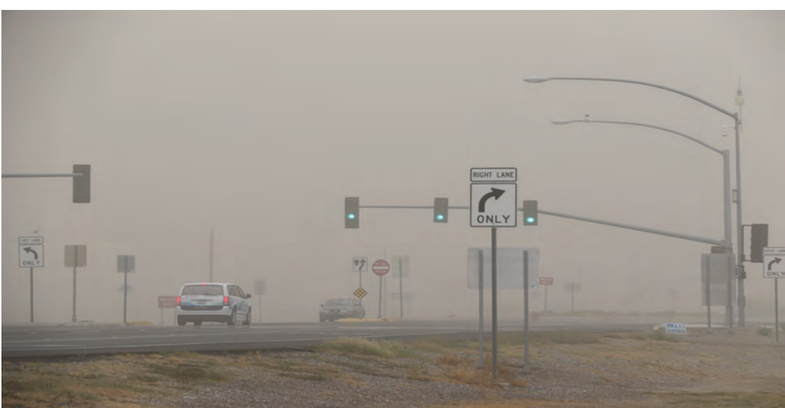
Above: a view of the storm in full swing heading south at the intersection of 347 and Farrell Rd. Visibility was very low as cars came to a slow pace. The storm passed within about a half hour and left dirt and debris all over the ground, vehicles and windows.