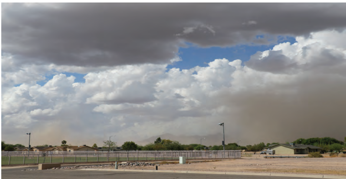
On September 23, 2019, Runner staff noticed a dust storm approaching from the north in Maricopa. The above photo shows the dust mixing with the blue sky around 2:30 p.m. on the north side of the Runner building.