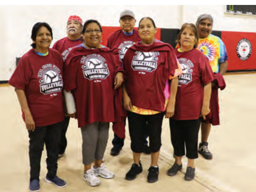
Above: First place winners S-hehe Gik O'odham.