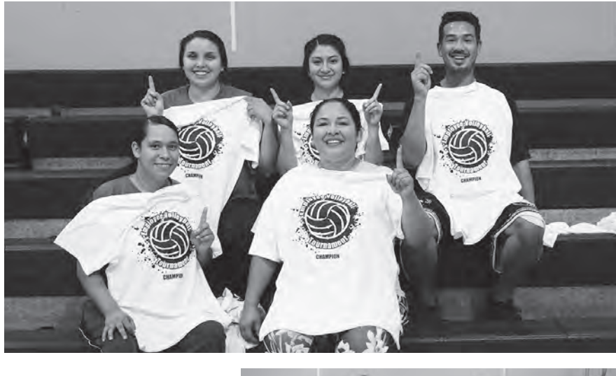
deserved bragging rights.

At the final whistle, Recsters would take the championship and well