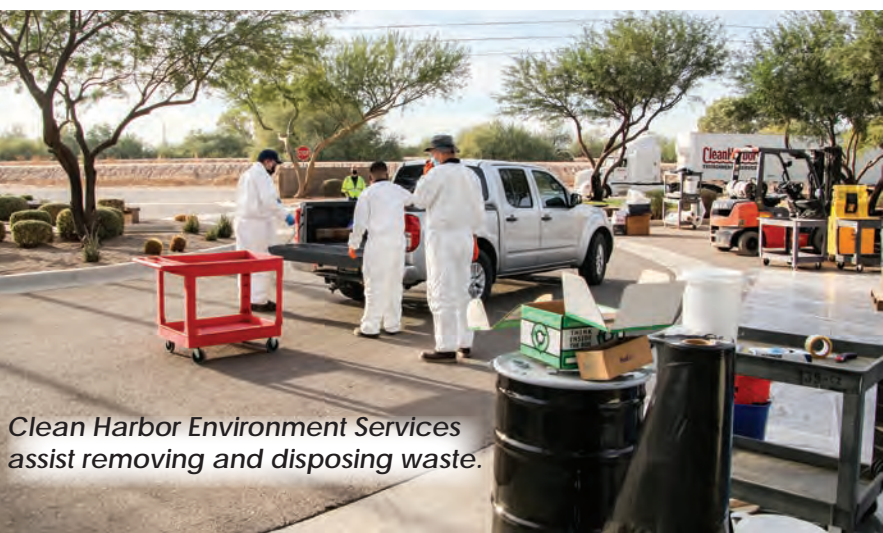
Clean Harbor Environment Services assist removing and disposing waste.

Ak-Chin Environmental Protection department hosted a day of proper waste disposal, household waste and E-Waste (Electronic Waste). They accepted everything from shampoos to drain cleaners, as these types of typical household items are usually improperly disposed of and damage the environment in various ways. On the morning of November 21st, the EPD staff welcomed everyone who brought in chemicals to be disposed of.