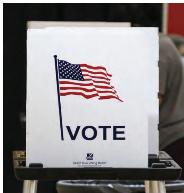
Community members get out and vote.

“Thanks to all membership who came out to vote at this year's election, including all individuals and departments who assisted prior to and during the election...Stay safe during the Holidays.” From the Ak-Chin Election Board.