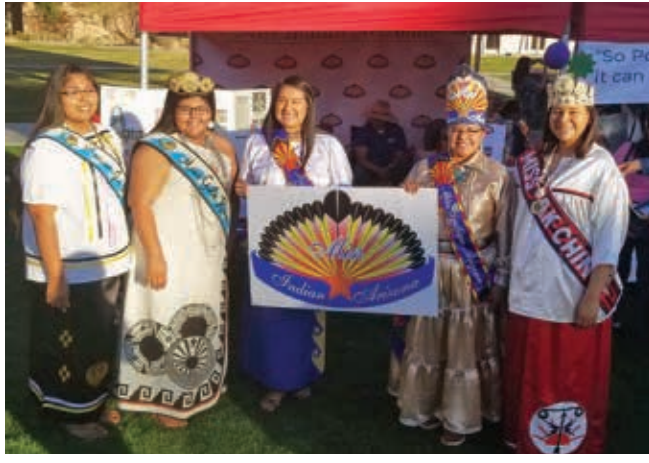
TOP: Miss Indian Arizona royalty with Miss Ak-Chin and Miss Gila River royalty.