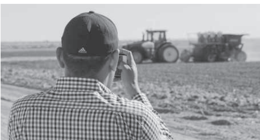
This photographer gets an up-close photo of one of Ak-Chin's potato planters. At right, students look at more of the potato processing plant equipment utilized on the farm during their tour.