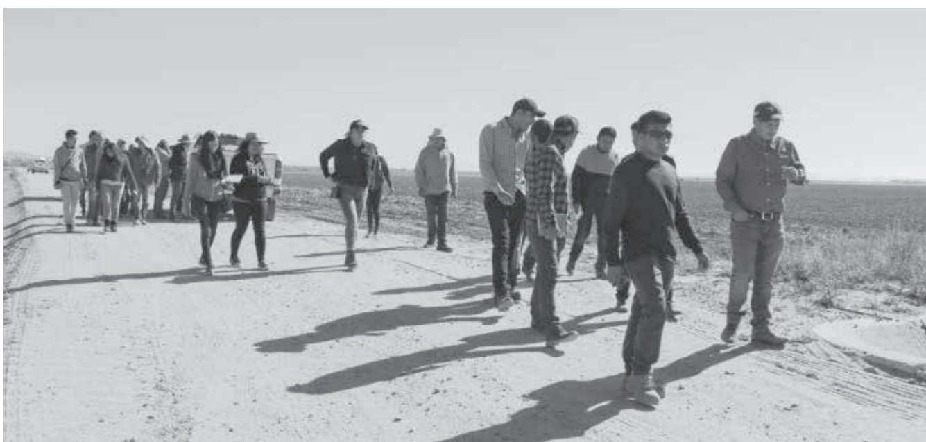
Students from the Universidad Autonoma Chapingo take some time to explore Ak-Chin Farms during a walking tour, before heading back to the council chambers to enjoy a nice lunch, on Friday, January 25.