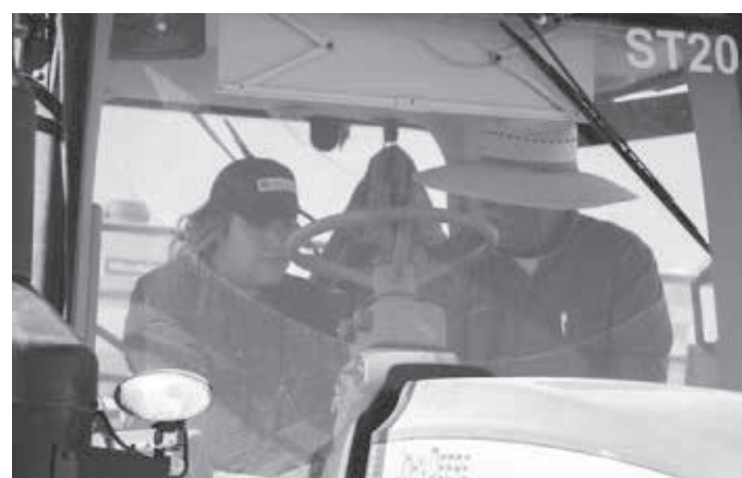
The students got to get a glimpse of the inside of the farm equipment.