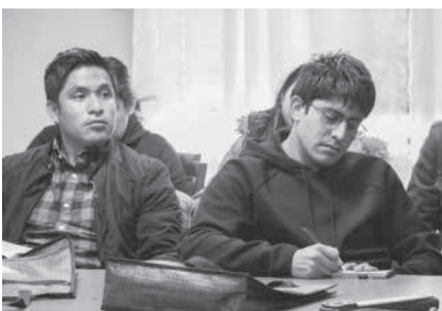
Students took notes on what they were learning throughout the tour.