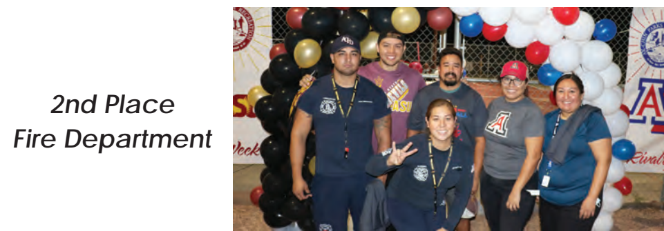
2nd Place Fire Department