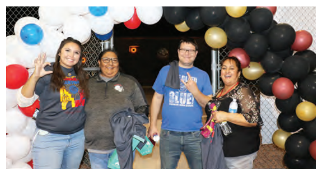
3rd Place Education Department