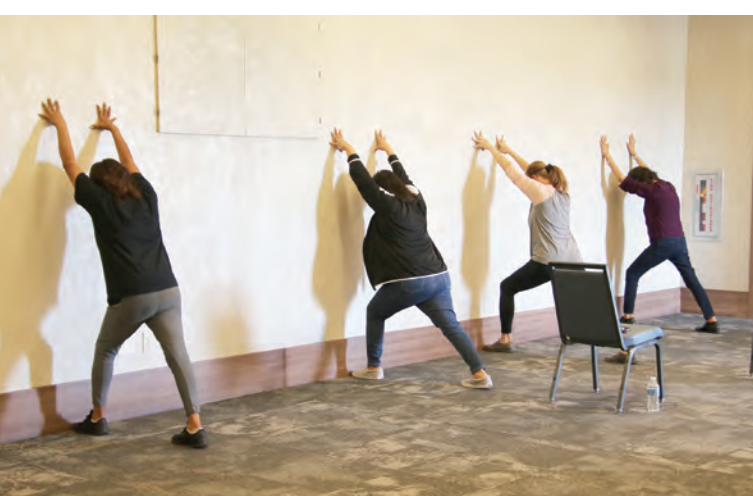
Participants during class session.

For the community, a class is provided to prevent and help