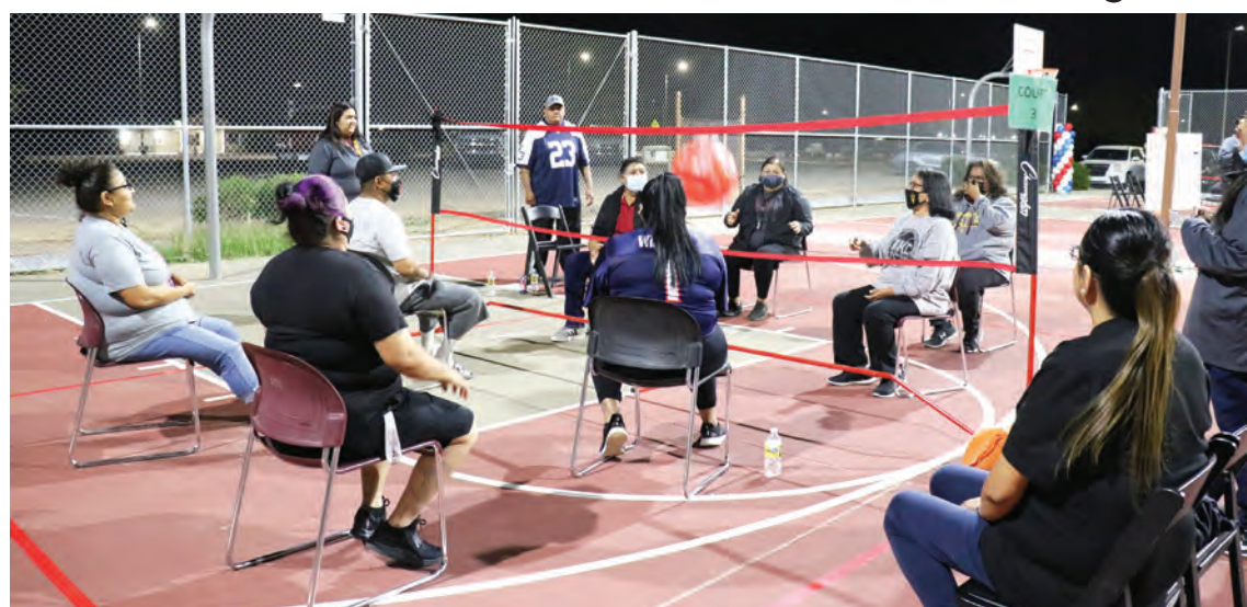
Tribal Council gets ready to send the ball back over the net to awaiting Lynx players.