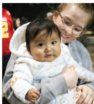
These two cuties enjoy the rivalry games.