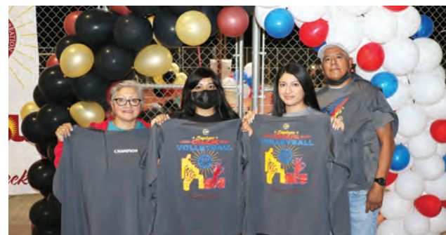
1st Place Birthday Squad