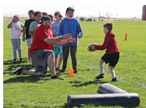
Kids line up and wait for their chance to run drills with Maricopa High School staff member.