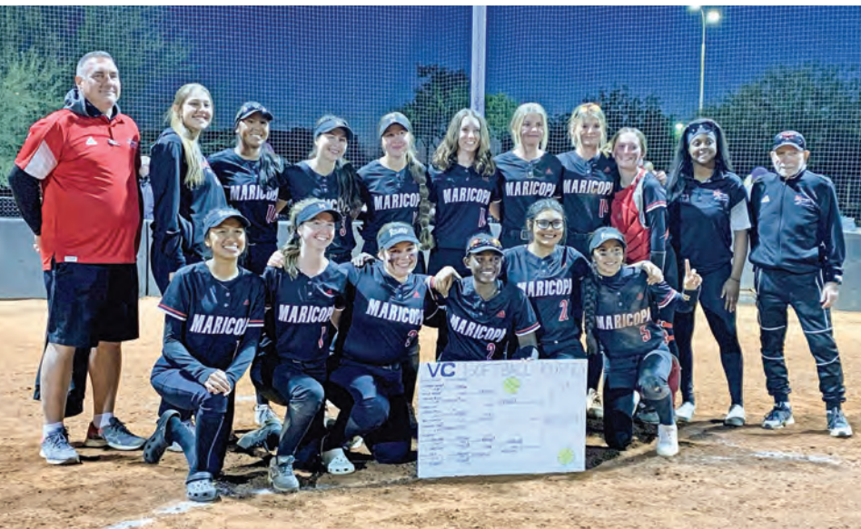
Maricopa Lady Rams, post Championship win.

The Maricopa Lady Rams softball team had an awesome weekend of wins during the Valley Christian Under the Lights Softball Tournament, February 24-26, in Chandler.