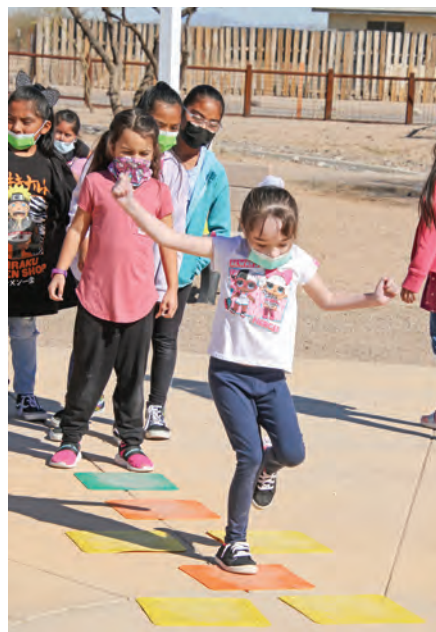
Right: As others watch, this little girl tries not to make any mistakes during a game of hopscotch.