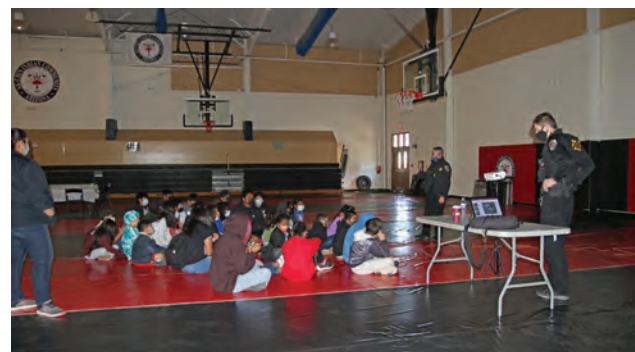
Ak-Chin Police Department gives the kids a presentation about bullying.