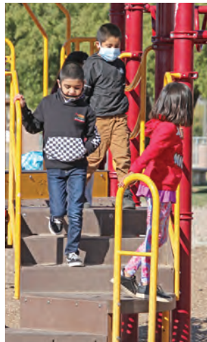
Children get a break from activities to stretch their arms and legs playing at the playground.

Week one, day one was a super great event that featured motivational speaker Rob Mendez,