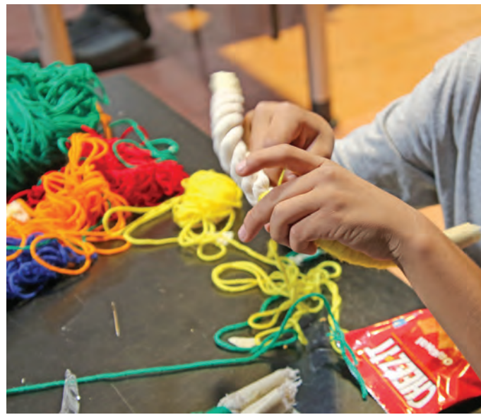
Kids learned how to make their own macrame wall art.