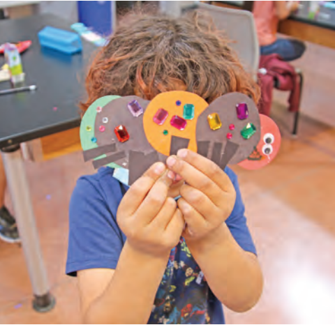
Left: Although he's camera shy, this boy wanted to show off his fancy looking bug.