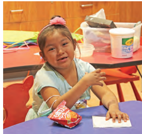
Right: Snack time is the best time :)