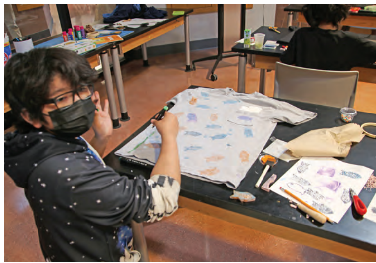
This kid's shirt looks a little fishy.